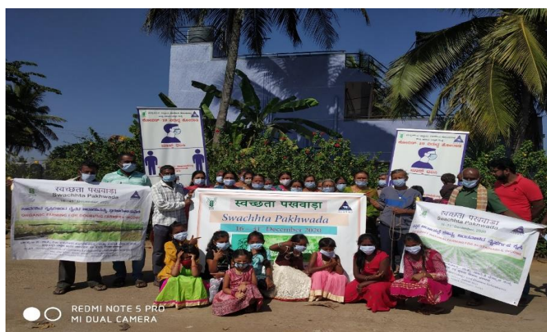
6. Awareness on 'Zero Budget Natural Farming in achieving sustainability in income'.