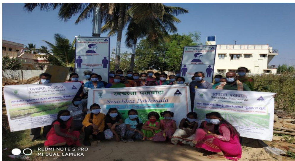
5. Awareness on 'Importance of organic farming in Doubling farmers' income'